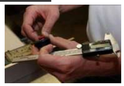
1. Loosen thumbscrew 1 ½ turns