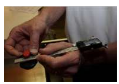
2. Slide caliper under washer